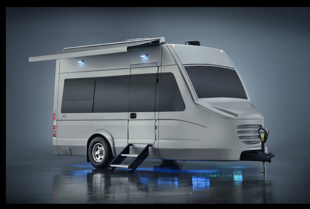
Trail Wagon AFE (Automotive Front End)